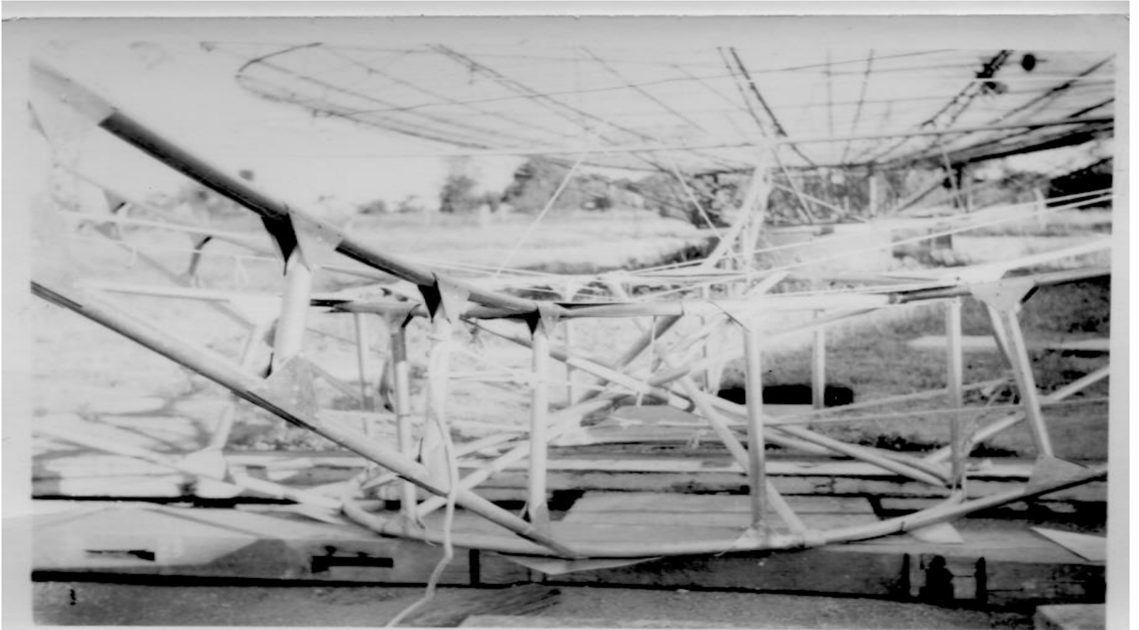
16 foot dish under construction with 28 foot dish in background