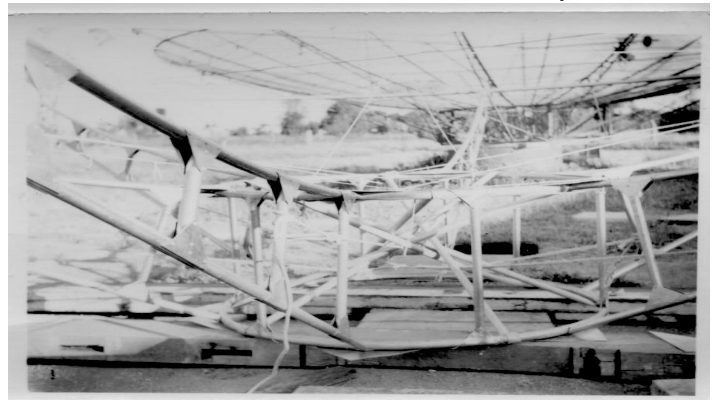
16 foot dish under construction with 28 foot dish in background